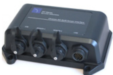
Sensor Interface (Optional)